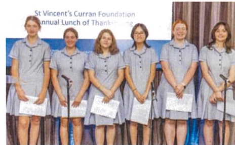
Benefactors Lunch 2023 St Vincent's College Choir